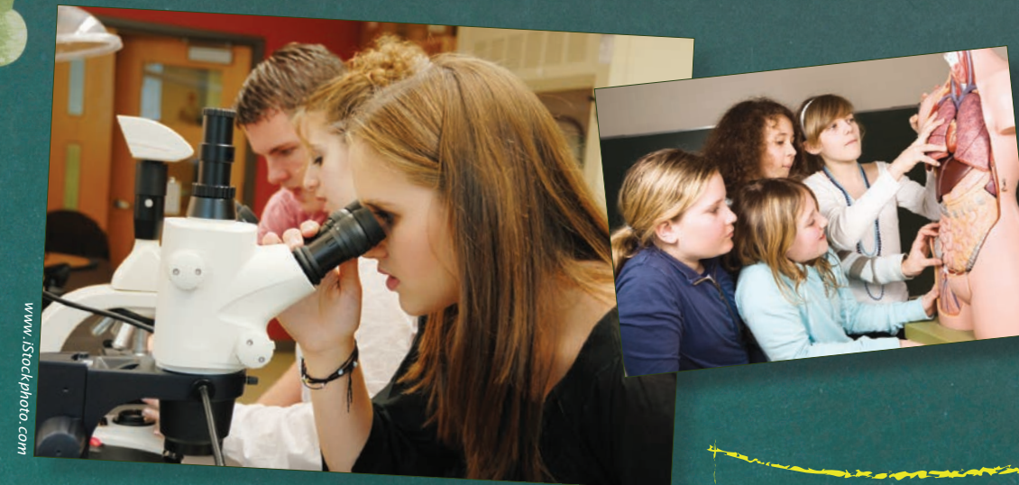
Non-dissection high school biology classes can include hands-on activities, such as examining microorganisms through a microscope or manipulating real-life plastic models.

Around the same time that Berenger began teaching only non-dissection biology courses, she made the decision not to have live animals in her classroom and brought them all home instead. "I feel that seeing an animal caged devalues the organism and encourages control over the species. It perpetuates the idea that you can take an animal out of its ecosystem, give it food and water, and that's okay." "Take gerbils, for example. What is their natural habitat? Where do they come from? What are their natural behaviors?" she asks. The first image that comes to mind for most of us is not the desert, but a glass tank furnished with shavings, a few toys and a wheel.