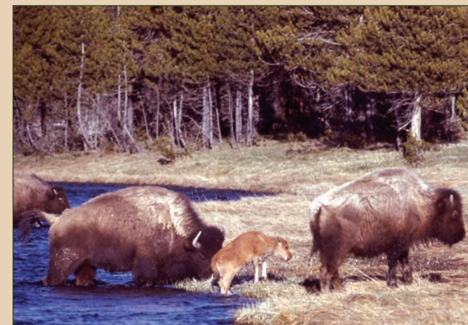
Due to an unjustified fear of disease transmission, over 1,500 bison have been killed outside Yellowstone this year.