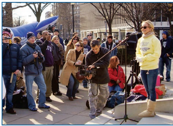
Addressing a crowd at Washington D.C.’s Dupont Circle, Hayden Panettiere speaks about her passion to save the whales and other marine animals.