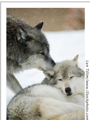
Anyone can kill wolves—for any reason—across 88 percent of Wyoming.

After spending millions of taxpayer dollars to recover gray wolves from the brink of extinction over the last decade, the FWS appears poised to allow their systematic extermination for a second time. Wildlife advocacy organizations have filed several lawsuits challenging the US government's actions to remove federal protections for gray wolves across the country. 🐾