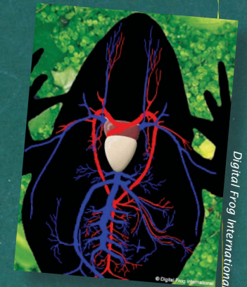
Digital Frog International