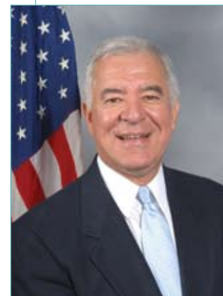
House Natural Resource Committee Chairman Nick Rahall (D-WV)