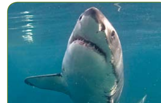
The Great White shark is one species that will gain protections from a recent ban on shark finning by the South East Atlantic Fisheries. PAGE 17