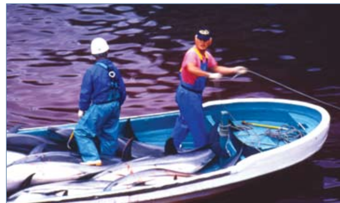
Left: Dolphins are lined up under a blue tarp and tied by their tail flukes so they cannot return to deep water. Right: After fishermen stab and slash dolphins with knives and hooks, the animals thrash about as they slowly die and turn the sea red with their blood.