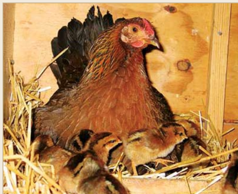
A bantam hen rests in a nest with her chicks.

Starbucks announced in January that it will move to end its use of milk products from cows treated with rBGH, starting with their removal from stores in Washington, Oregon, Idaho, Alaska, Montana, Northern California and New England. The company has not announced a date when it will completely stop purchasing dairy containing the artificial growth hormone. Organic milk (which is not necessarily humane) is currently available at all Starbucks upon request. 🐾