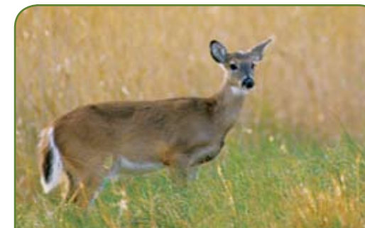
Our wildlife award program funds non-lethal management projects, such as non-invasive sampling techniques for deer. PAGE 20