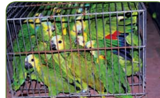
Cramped quarters and extreme stress for birds during transport encourage the outbreak of infectious diseases such as avian influenza. PAGE 12