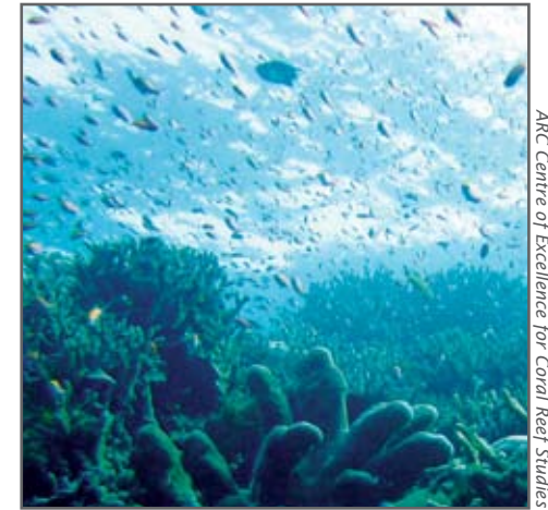
ARC Centre of Excellence for Coral Reef Studies