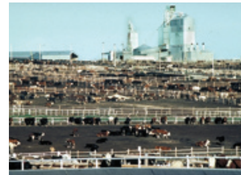
The vast majority of cattle raised for beef are confined to barren feedlots in the months prior to slaughter. AWI standards prohibit this practice. (See story page 6).

Who's Watching Congress While We Sleep? Horse Protection Readdressed by Legislation...20