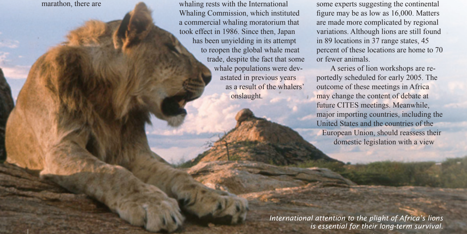
International attention to the plight of Africa's lions is essential for their long-term survival.