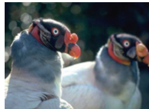
Magnificent birds such as the King Vulture, pictured above, as well as 93 other non-native migrating species, are victims of anti-animal measures slipped through Congress last year. (See story page 20).