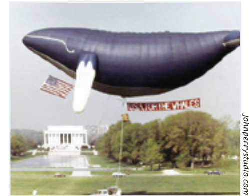
The icon of the Save the Whales campaign, Flo the inflatable whale, was a regular Washington, DC visitor in the 1970s.

Whales are still endangered and have not yet recovered to historic, pre-exploitation levels. Additionally, there is growing evidence that other human-caused impacts, including ship-strikes, noise and toxic pollution, are affecting whale populations. Whale meat has become increasingly dangerous to eat because of the bioaccumulation of toxic substances, and several whaling nations have issued health warnings for its consumption. Coincidentally, demand for the meat has declined, as evidenced recently when Japan reintroduced it into hundreds of school lunch programs in Wakayama Province. Finally, the multi-million dollar whale-watching industry is proving far more lucrative than whale killing, and it is rapidly growing. Sadly, intransigence is keeping whaling alive in the majority of whaling nations, and the IWC is allowing it to thrive. 🐾