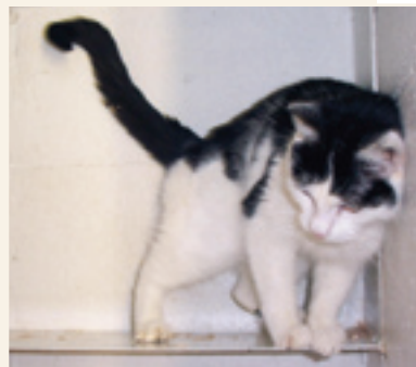
One of almost 200 cats rescued from Martin Creek Kennels.

We cannot rest on our laurels until every animal dealer supplying "randomly acquired" dogs and cats to research facilities is put out of business. For more information on how to adopt a rescued dog or cat, please contact AWI. 🐾