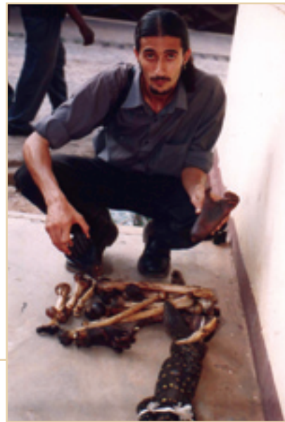
The author shows severed Chimpanzee hands, confiscated from bushmeat dealers.