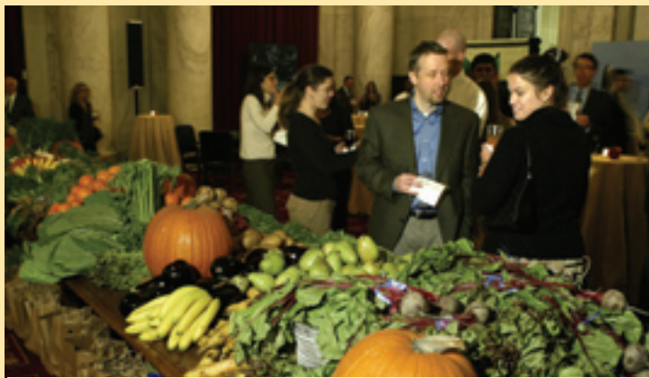
Whole Foods provided a cornucopia of fresh fruits and vegetables, and guests were able to fill a grab bag with wholesome goodies to take home.