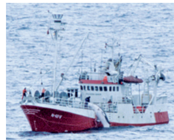
The killing of a minke whale by the crew of the Norwegian whaling vessel, Willassen Senior, is captured on videotape by undercover investigators.