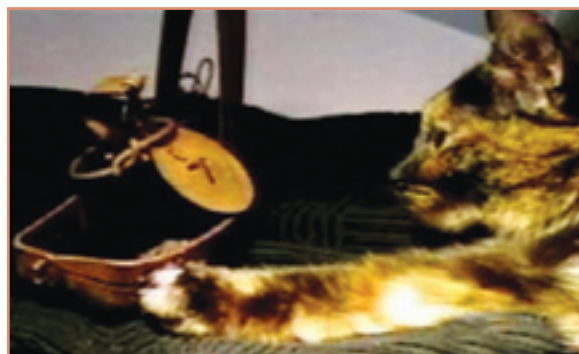
Two-year-old Princess accidentally fell prey to a barbaric steel trap; a portion of one of her paws had to be amputated as a result.

Due to its non-selective nature, the steel jaw leghold trap not only causes endless suffering to intended targets, but to pets, deer, birds, endangered species and even children. Eighty-eight nations have already banned the trap in recognition of its inherent cruelty. Representative Nita Lowey (D-NY) and Christopher Shays (R-CT) introduced the Inhumane Trapping