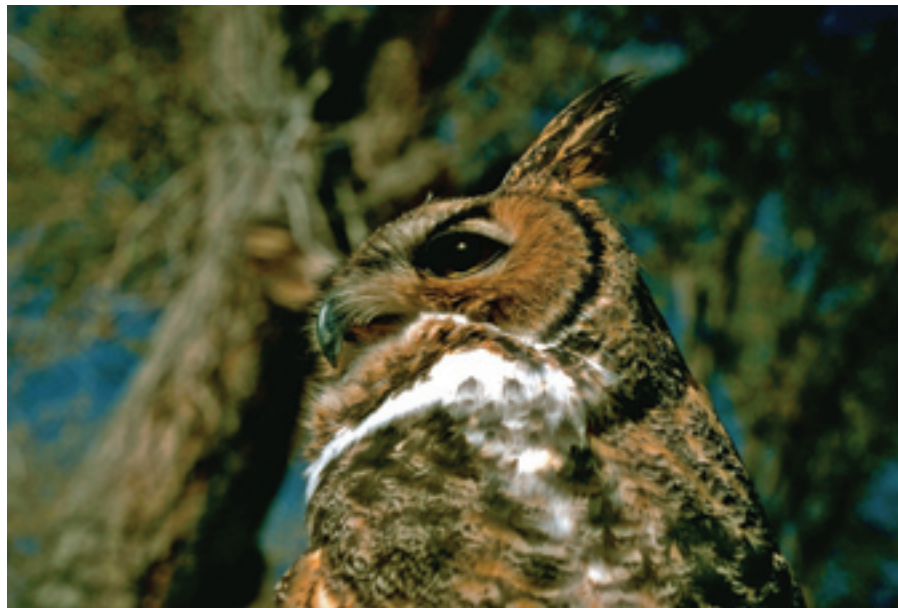
Famphur, an insecticide commonly applied topically to livestock, is harmful to many species of birds who interact with cattle. Raptors such as the great horned owl risk secondary or tertiary poisoning as the chemical infects the food chain.

Meanwhile, avian influenza continues to flourish, largely due to the weakened immune systems of birds raised for meat who are force-fed mass quantities of antibiotics and housed together in cramped sheds. More than 60 people have died after contracting the virus, and officials have culled at least 140 million birds as a result. 🐾