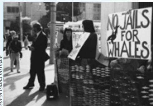
Earth Island Institute