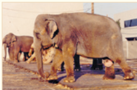
Between performances, Ringling elephants are confined by chains around their legs.

While the event was a success, more funds are needed desperately for this costly effort. Donations earmarked for this litigation are tax-deductible and much appreciated; please contact us to learn how you can pledge your support or protest a Ringling performance in your hometown. 🐾