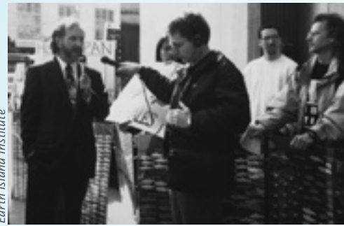
Earth Island Institute