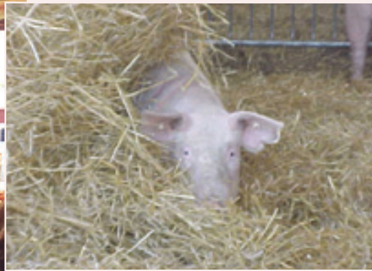
Left: Deep-bedded group sow housing on a Swedish pig farm.