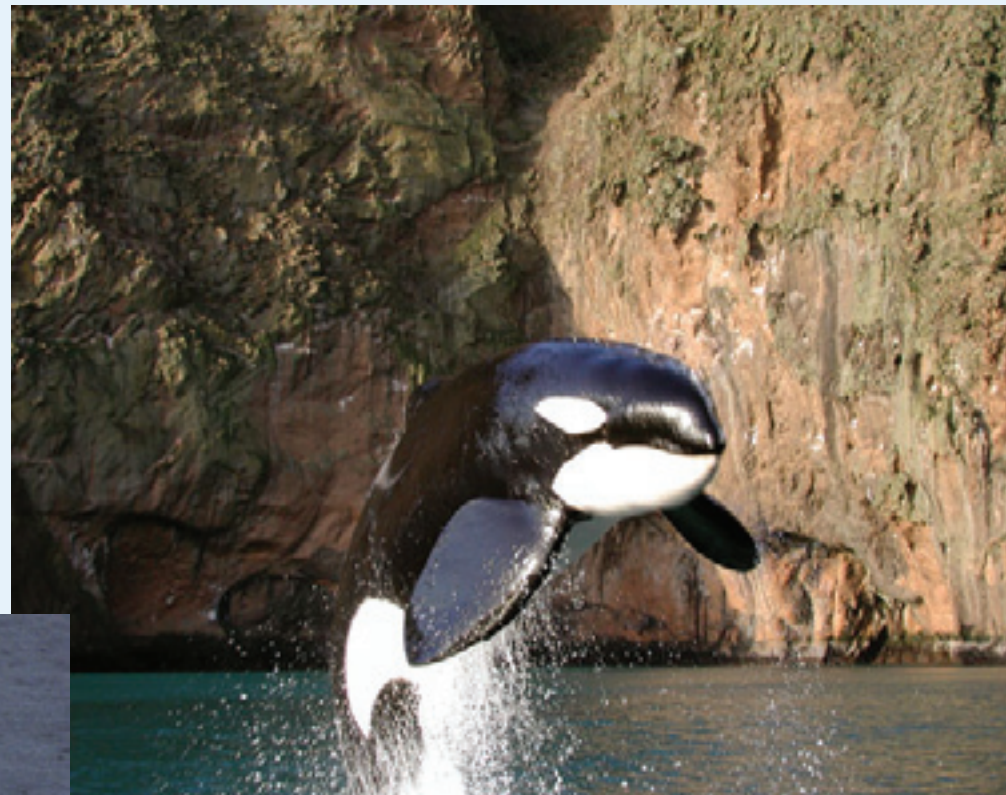
Keiko plays in Taknes Fjord—a long way from a concrete tank.

Ten years ago I led a delegation to Mexico City to negotiate with the amusement park Reino Aventura to give up Keiko the orca whale to a coalition dedicated to his release. Keiko had just become the most famous whale in the world by starring in Free Willy . When I saw him, my heart fell. He was sway-backed like an old horse because he had starved himself to shrink his Icelandic blubber and stay alive. His teeth were worn to nubbins and his gums bled from chewing on the sides of his tank. Papiloma rash spread from his pectoral fins and his dorsal fin had the trademark captive orca droop.