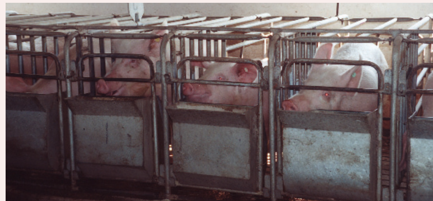
Crate-housed pregnant sows in this pig factory wait for their only feeding of the day—4 pounds of concentrate that most of them will have consumed in fewer than 10 minutes.