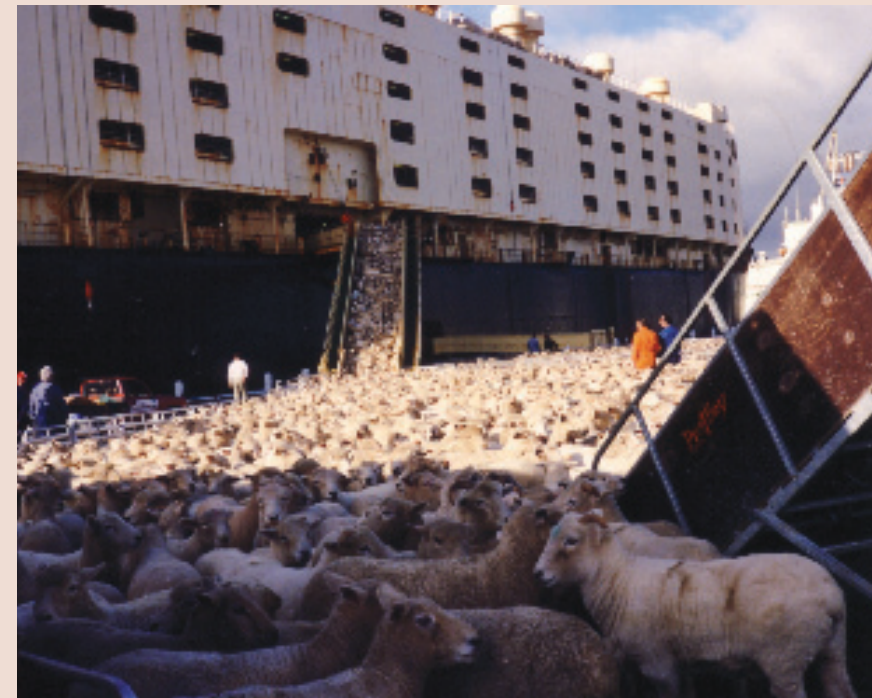
This trading of live animals is inhumane and must end. At the very least, journey length should be limited and contingency plans instituted.