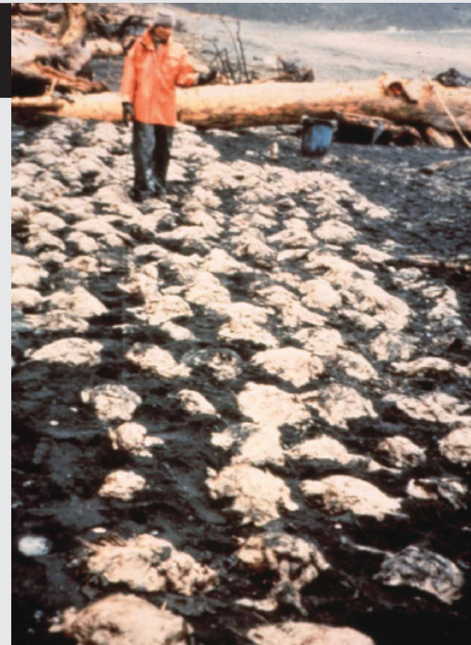
The Exxon Valdez oil spill occurred during the annual spring migration of waterfowl to Prince William Sound. Hundreds of thousands of seabirds, including these murre, died from oil coating.

These attacks are possible for three reasons. First, Exxon is so powerful economically that a substantial proportion of the active participants in the small field of oil pollution research find that it pays well to advance company policy. These consultants are often asked to peer-review contributions to scientific journals, and the anonymity of the process provides an open door for abuses. Economic clout may also be an effective tool for manipulating the agendas of scientific meetings (e.g. by ensuring that Exxon-supported scientists always speak after government scientists to facilitate rebuttal). Second, while unethical, it is not illegal to publish knowingly false information in a scientific journal, provided the funding source is private. Numerous safeguards are in place to prevent publicly-supported scientists from lying in print, but these simply do not apply to their privately-funded counterparts. Third, unlike government scientists, the data and records of privately-funded scientists may be kept secret, so their research contributions may escape the scrutiny necessary to expose scientific fraud.