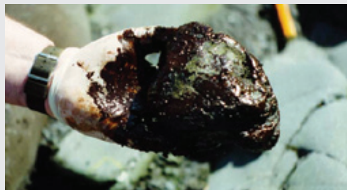
Belying Exxon’s claims of rapid recovery, relatively fresh and toxic oil persisted for over a decade on the beaches that were hardest hit by the spill, such as this oil at Sleepy Bay in 1999.

Exxon has tried to portray the region impacted by the spill as having already been polluted by other sources, and in any case as fully recovered by the early 1990s. Their position is likely motivated by the “re-opener” clause of the civil settlement between Exxon and the governments of Alaska and the United States, which provides for up to $100 million in additional payments to cover restoration costs of any unforeseen damages. To support their position, Exxon has supported a host of studies by their consultants and launched a campaign to intimidate and discredit publicly-supported scientists whose studies are contradictory. Tactics have included misrepresentation of government data, manipulating agendas of scientific meetings, abuse of the scientific peer-review process, shadowing government field studies and groundless allegation of scientific misconduct.