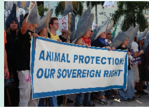
Marchers wear dolphin hats as they walk during an FTAA demonstration.