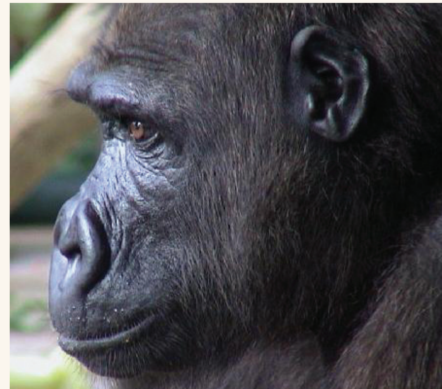
Twigs is a gorilla confiscated from a Lebanese businessman who had kept her as a pet. She has now settled in a new life at the Limbe Wildlife Center in Cameroon.