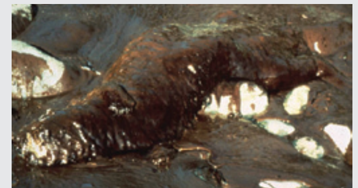
Marine mammal populations were hit hard by the spill. Thousands of sea otters (above), along with hundreds of sea lions and seals died from oil coating or from fume inhalation.

In his last book, The Demon-Haunted World , Carl Sagan made a passionate plea for keeping science honest, lest we fall into a modern version of the dark ages. Scientific reform has yet to achieve the attention it deserves, not least because scientists like to think of themselves as above all that. But without more effective safeguards, the process and indeed the products of science may become little more than a sophisticated form of advertising, and our ability to deal effectively with the host of environmental, human health and food safety problems that face us may become seriously compromised, with potentially tragic consequences. 🐾