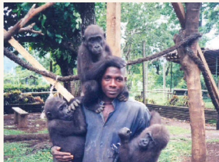
Left: One of the four gorillas smuggled from Nigeria to Malaysia in January 2002: her fate still hangs in the balance, will it be a zoo in South Africa or a sanctuary in Cameroon?