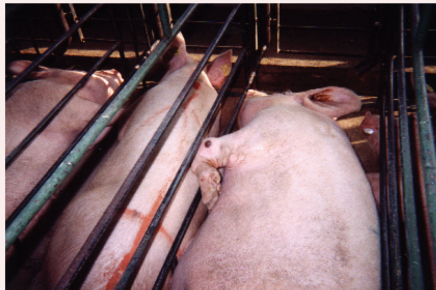
Pregnant sows forced into uncomfortable positions by their crate "homes" at one of the nation's largest pig factories, a supplier to a major US fast food chain.